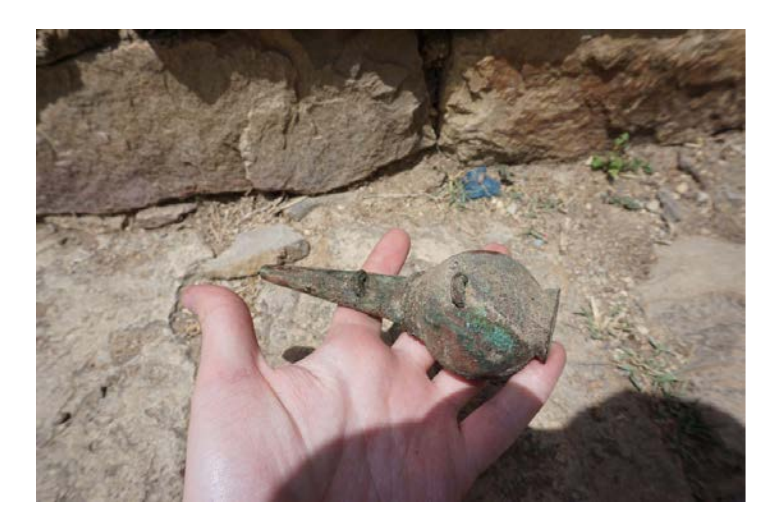
Nazret qumqum, documented exogenously in 2018

Fatimid-era connections between Ethiopia and the Maghrib through Egypt.