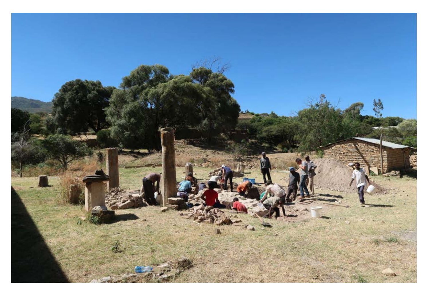
Workers clearing and excavating the buried pavement of Marvam Nazret

unprecedented in Ethiopia, only underscores this site's elite Fatimid connections.